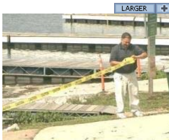
A sewage overflow at a Cary pump station prompted park officials to close Lake Wheeler in Raleigh.